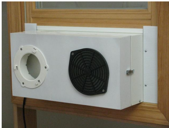
Figure 3: Hold the Fresh Air Duct Adapter up to the face of the ERV with the latches swung to the sides, then secure the latches to the strikes and close them.

Hold the PuriFresh® Fresh Air Duct Adapter up to the face of the PuriFresh® Energy Recovery Ventilator, with the latches swung to the sides. Secure the latches to the button strikes and close them, securing the Fresh Air Duct Adapter to the Energy Recovery Ventilator as shown in Figure 3.