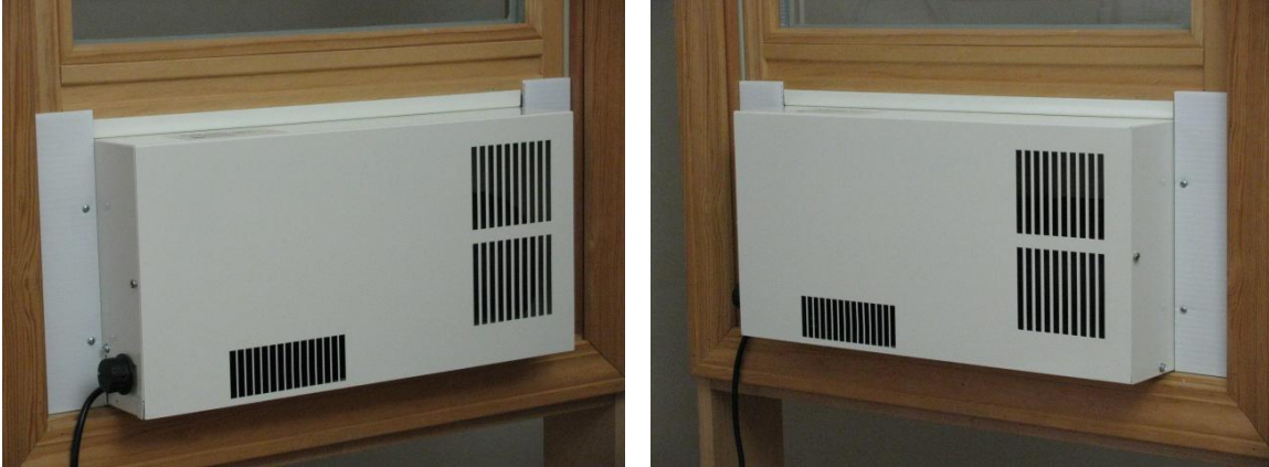
Figure 2: Screw the two sheet metal screws with strikes into the two holes, one on each side of the PuriFresh® ERV.