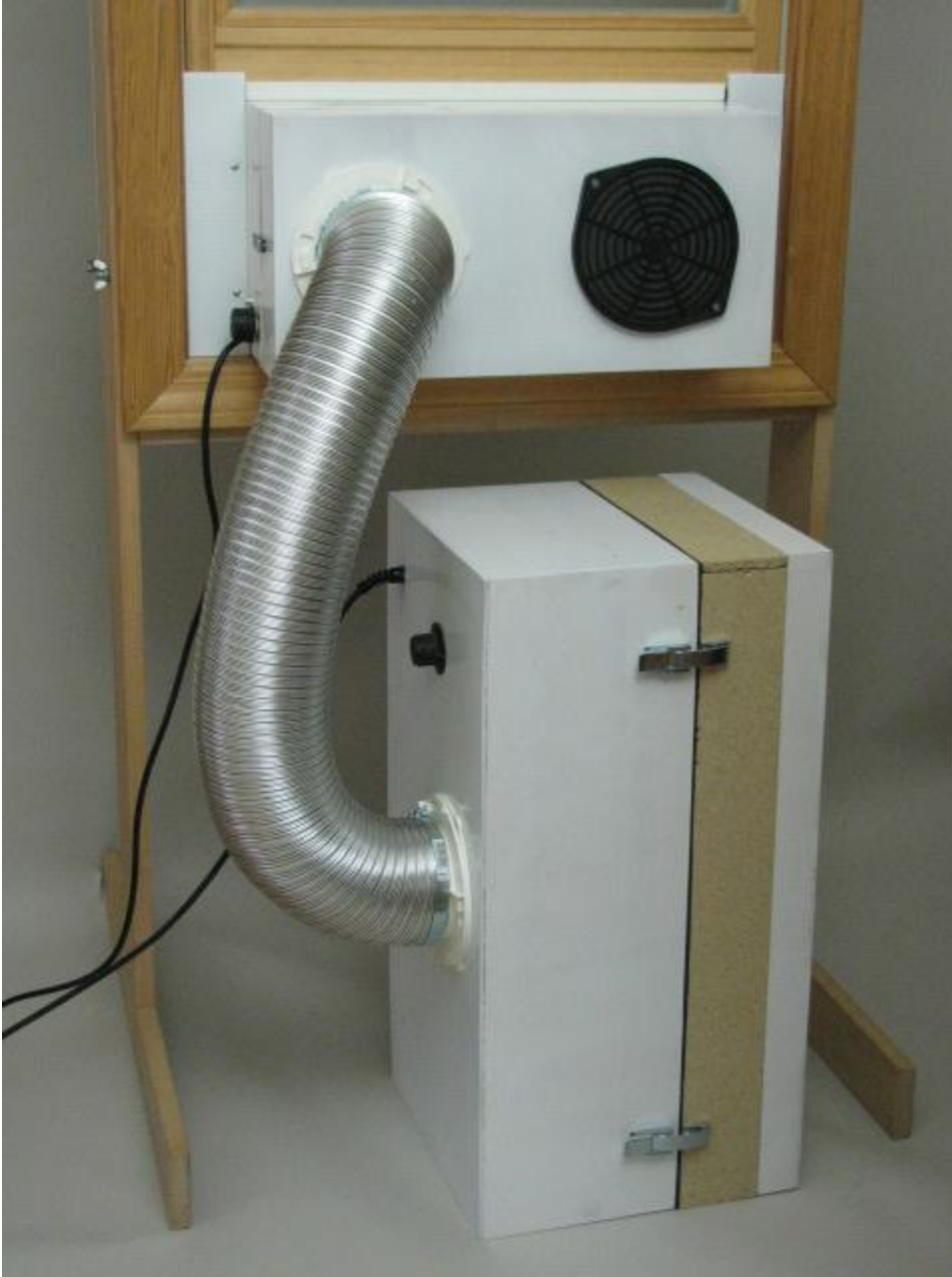
Figure 4: The PuriFresh® Clean Room connected to the PuriFresh® ERV using the PuriFresh® Fresh Air Duct Adapter.